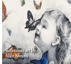
By: Grace Pajon and Kayra Yuzbasioglu

hance your imagination and express yourself through the arts with your unique twist!