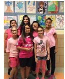
We Think Pink!