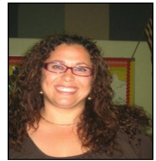
Words of Wisdom

In order to succeed, your desire for success should be greater than your fear of failure.